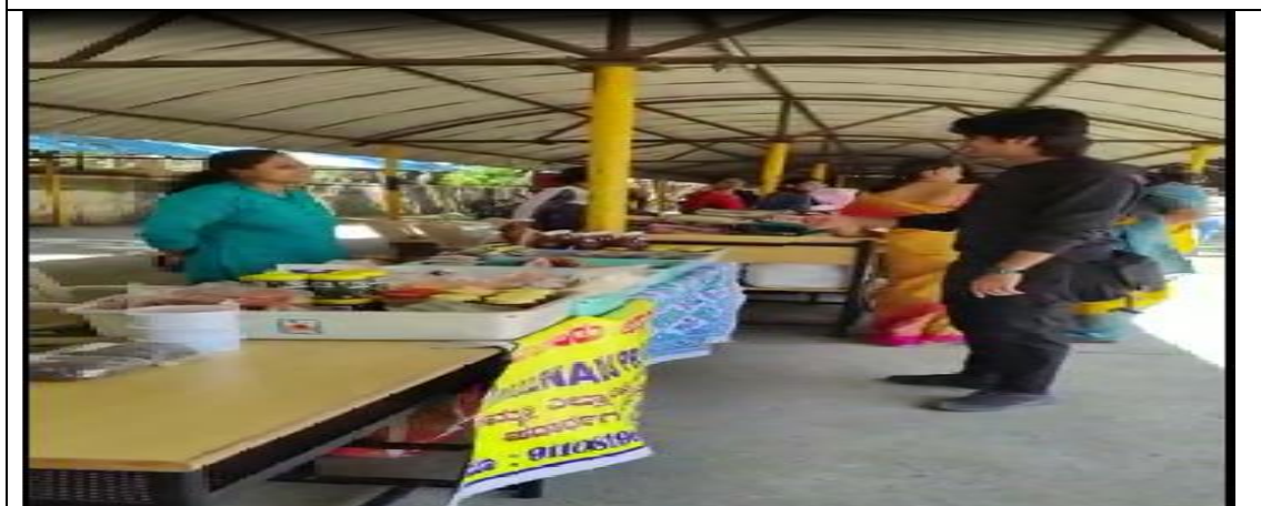
FLEA MARKET Stalls