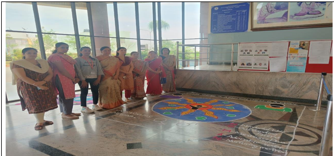
Rangoli - Competition on occasion of International Women's Day 2023