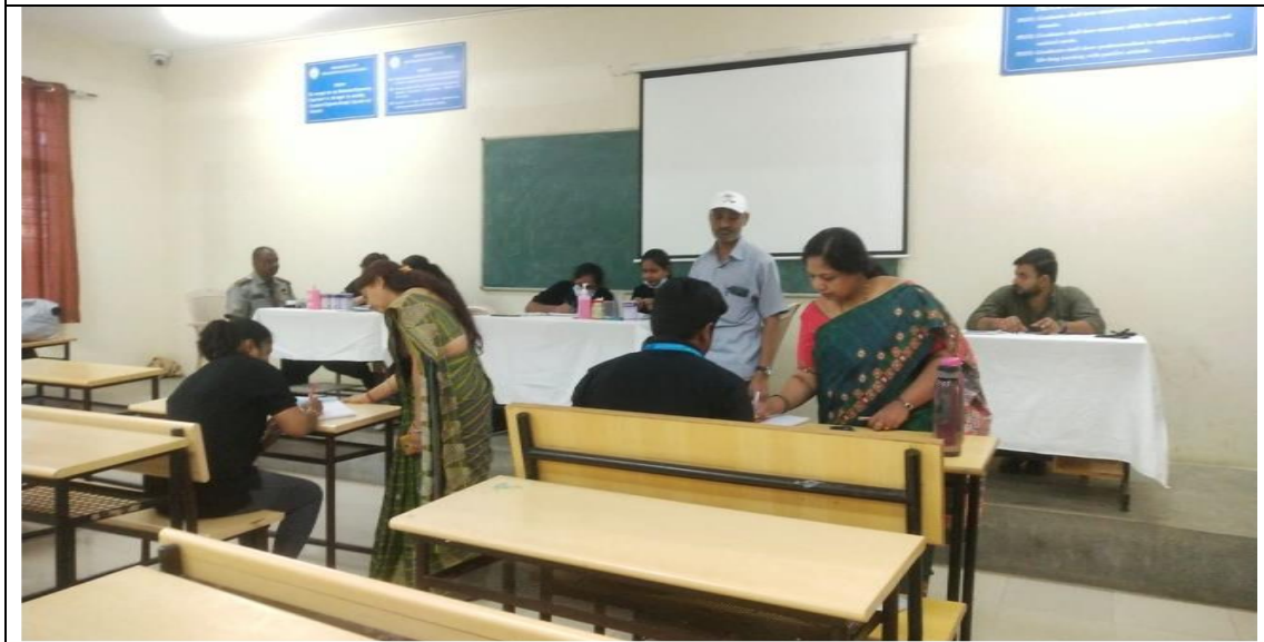
Registration and Health checkup