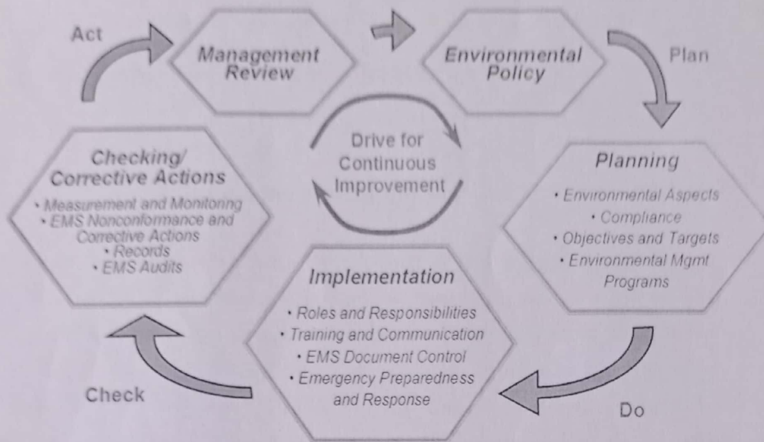
Figure.2 Environmental management policy