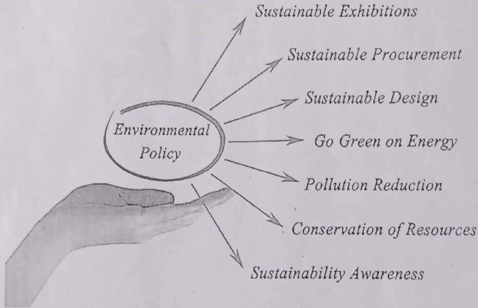
Figure.1 Environmental policy and Legislation

The institution environmental policy has been formed to sustainable development and provides employees a safe, harmonious working environment, as well as embracing corporate environmental responsibility. To this end, were committed to green policy: "Energy Conservation, Waste Reduction, Resource Recycling and Regulatory Compliance" and expect to build a better environment for our future generations. The figure 1 as shows the institution environment policy and legislation