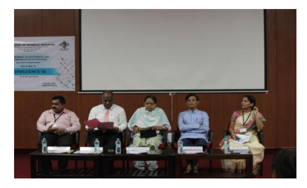
Fig. 1: Dignitaries on the DAIZ on 9<sup>th</sup> April 2018.

The confluence was sponsored by Café BOX, SCP Ready MIX, Endeavor careers, Bangalore and Shiva XEROX.