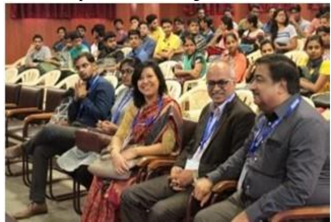
Eminent speakers and Participants