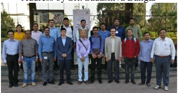
Participants and Resource Persons