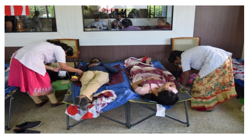
Blood collection from donors

We are thankful to principal and management for providing all facilities to conduct blood donation camp.